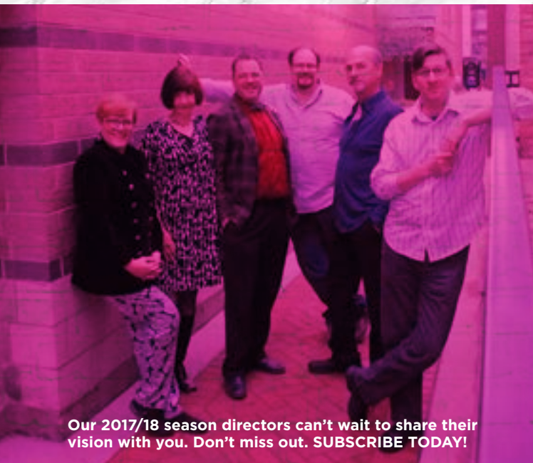
Our 2017/18 season directors can't wait to share their vision with you. Don't miss out. SUBSCRIBE TODAY!